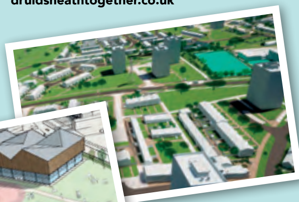
Left to right: Our new website; a concept sketch of community amenities; and a digital 3D model of the estate.