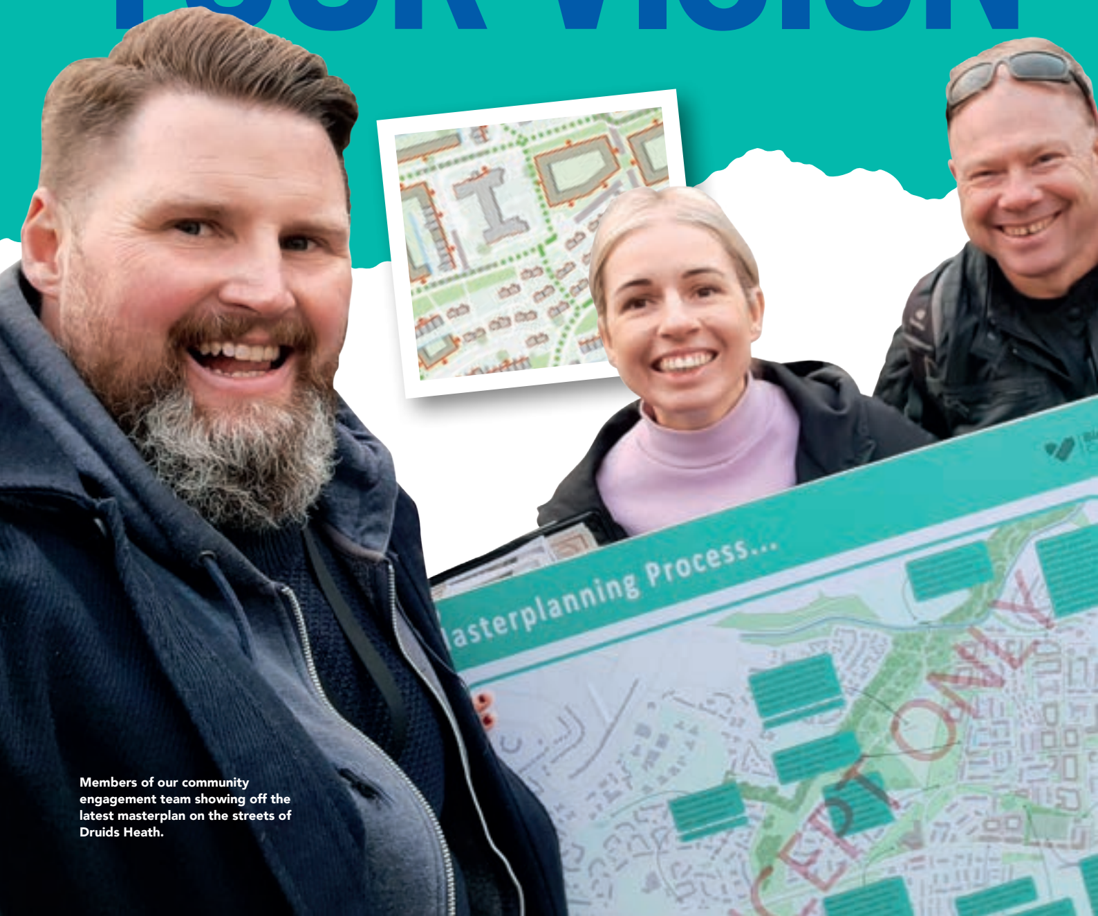
Members of our community engagement team showing off the latest masterplan on the streets of Druids Heath.